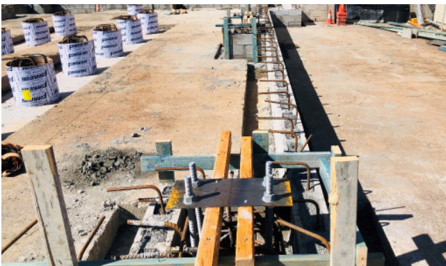
PLATE FREEZER FOUNDATIONS

A highly robust and level concrete foundation, suited to the purpose of upholding pre-fabricated steel rainwater tanks.